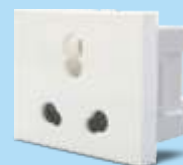
Code : 2104 6/16 A, 3 module multisocket with shutter