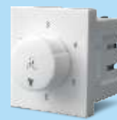
Code : 2013 Stepped fan regulator (360° rotation)