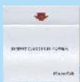
Code : 2014 20A, 230 V card operated switch