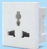
Code : 2102 6A, 3 pin 2 module multisocket with shutter