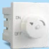
Code : 2012 Light dimmer 600 W