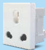
Code : 2103 6/16 A, 2 module multisocket with shutter