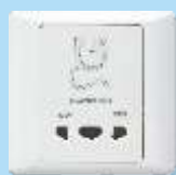
Code : 2105 110/230 V shaver socket